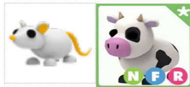
You can even get a pet

In Adopt Me, you can choose a role and become either a parent or baby, is child People play it to trade good pets (like shadow dragons and frost dragons). Your pets can become neon, mega neon, rideable and flyable. You can ride and fly your pets. Isn't that amazing!