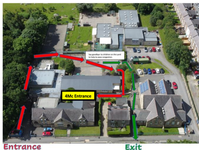
Diagram showing way to enter school and leave in the morning:

Red is how you enter school → Green is how parents exit school →