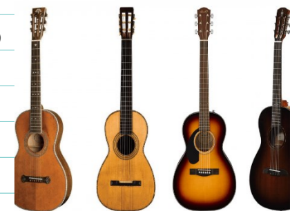
A variety of acoustic guitars.