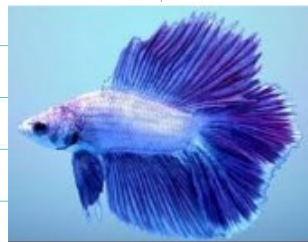
Fighter fish come in many forms and colours.

Behind Angel Fish these amazing fish are super cool. Despite their name, they do not tend to fight unless there are 2 males. These fantastic fish have long, luxurious fins, which often are extremely graceful when they move. They also can come in many forms and colours. Here are just a few: black, white, electric blue, translucent skin, copper, green.